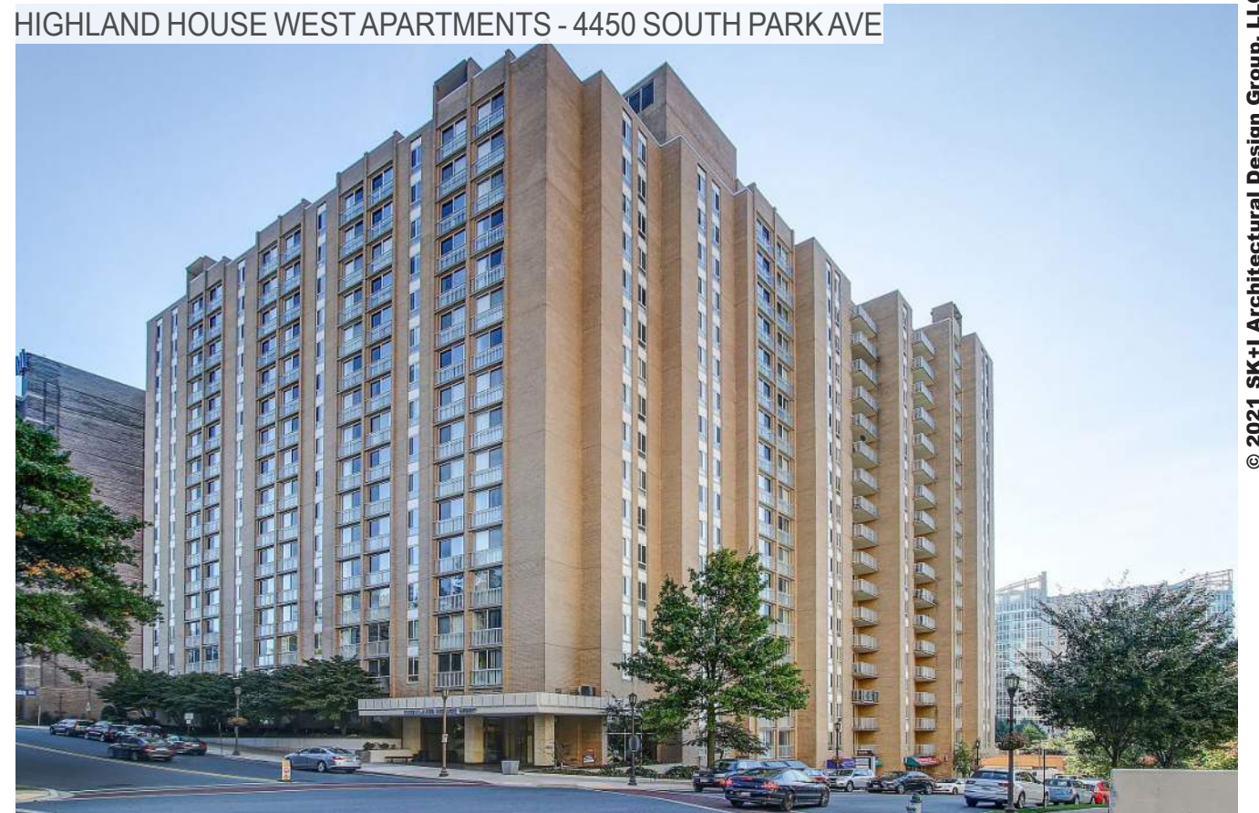
HIGHLAND HOUSE WEST APARTMENTS - 4450 SOUTH PARK AVE