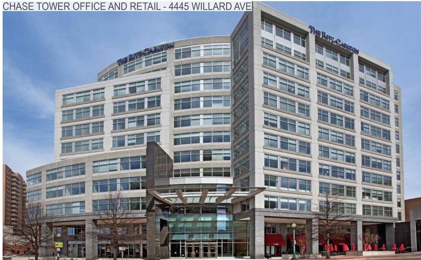
CHASE TOWER OFFICE AND RETAIL - 4445 WILLARD AVE