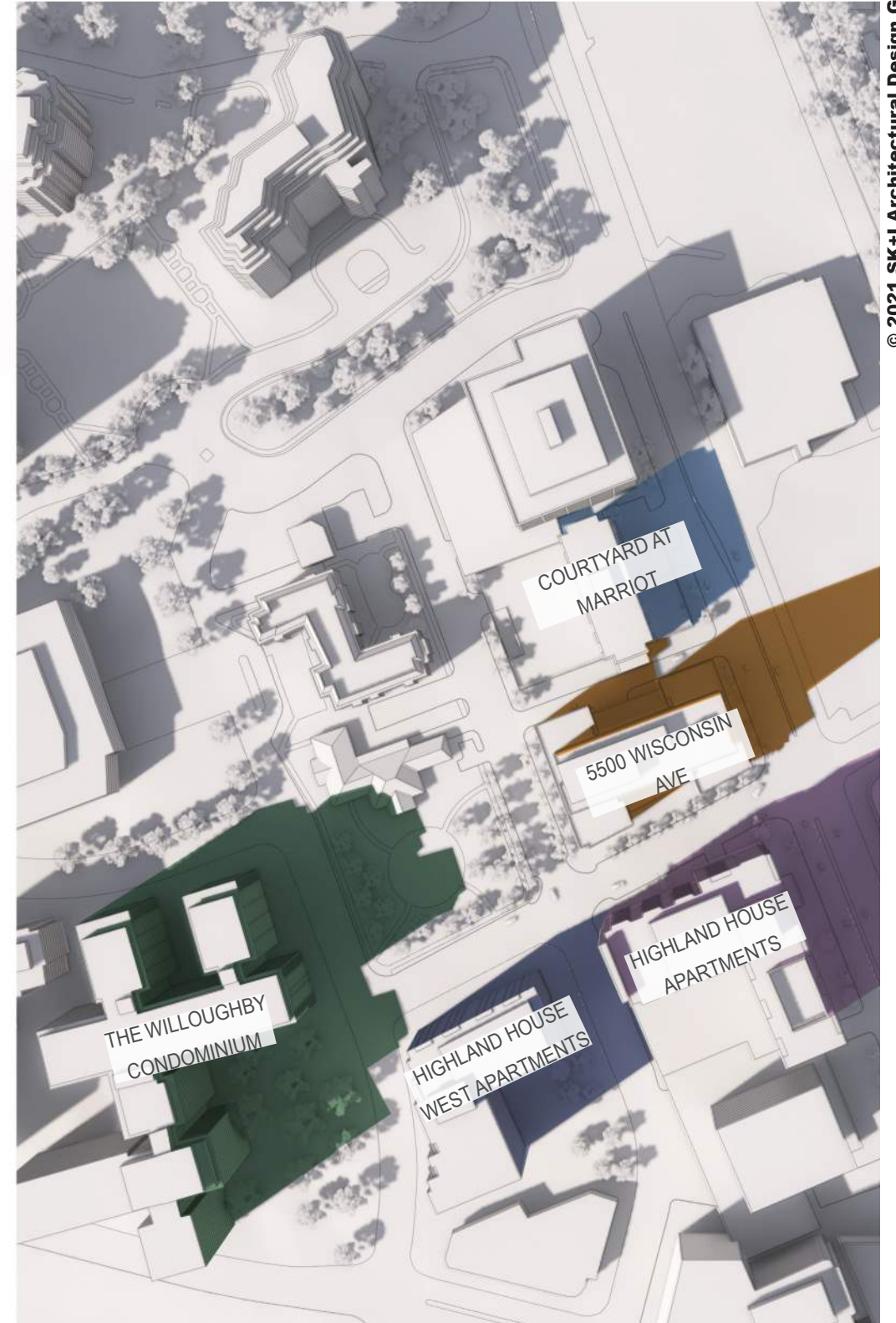
MARCH 22ND 3PM

5500 wisconsin Ave | village of friendship heights - chevy chase, md