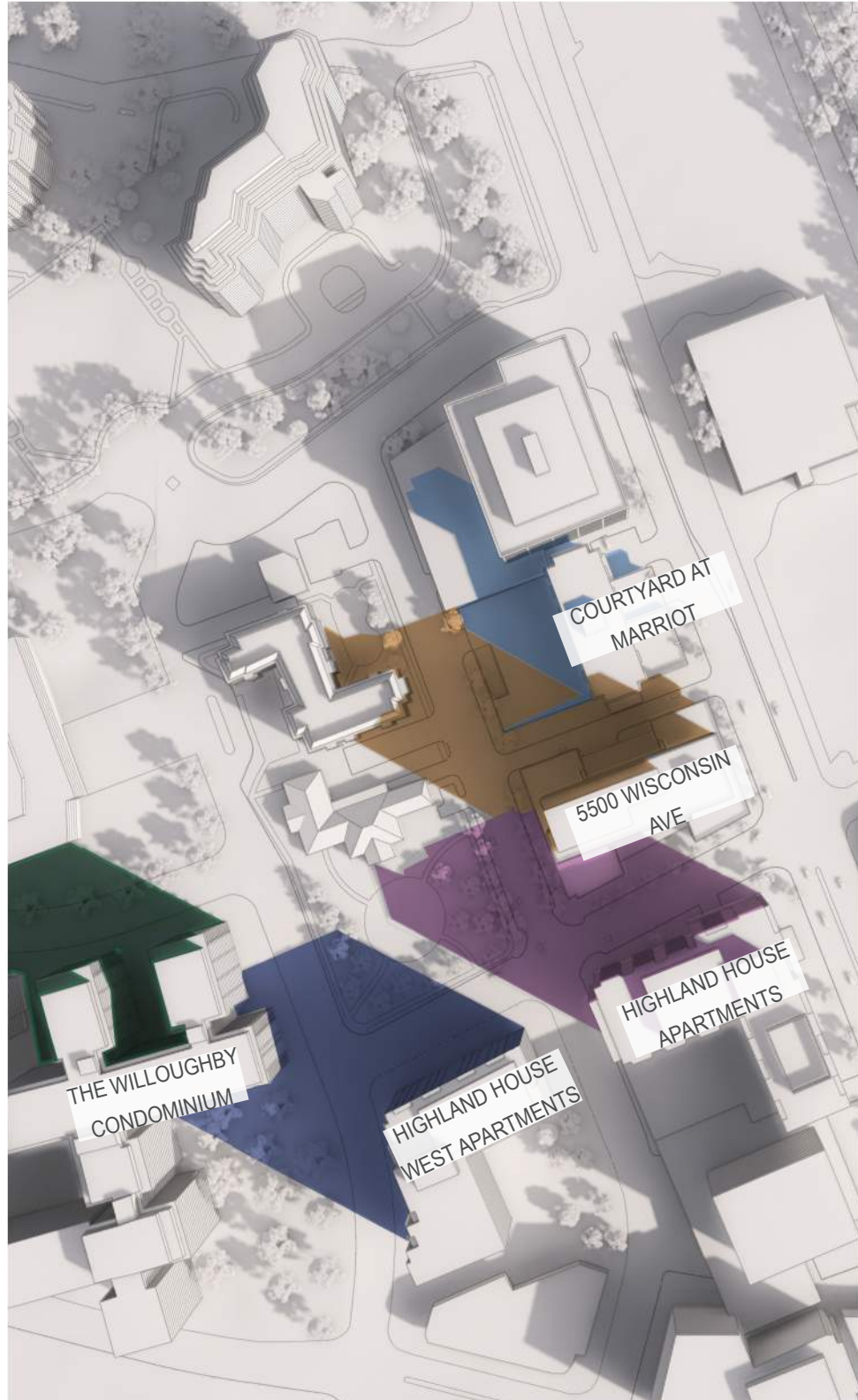
MARCH 22ND 9AM

Project has been sited to avoid casting shadows on Hubert Humphrey Park and nearby residential. Shadow of the proposed residential and retail is shown in brown. Shadows are cast primarily onto the Property itself (e.g. the Courtyard by Marriott hotel that is part of the overall Project) and the surrounding commercial and parking uses, not residential.