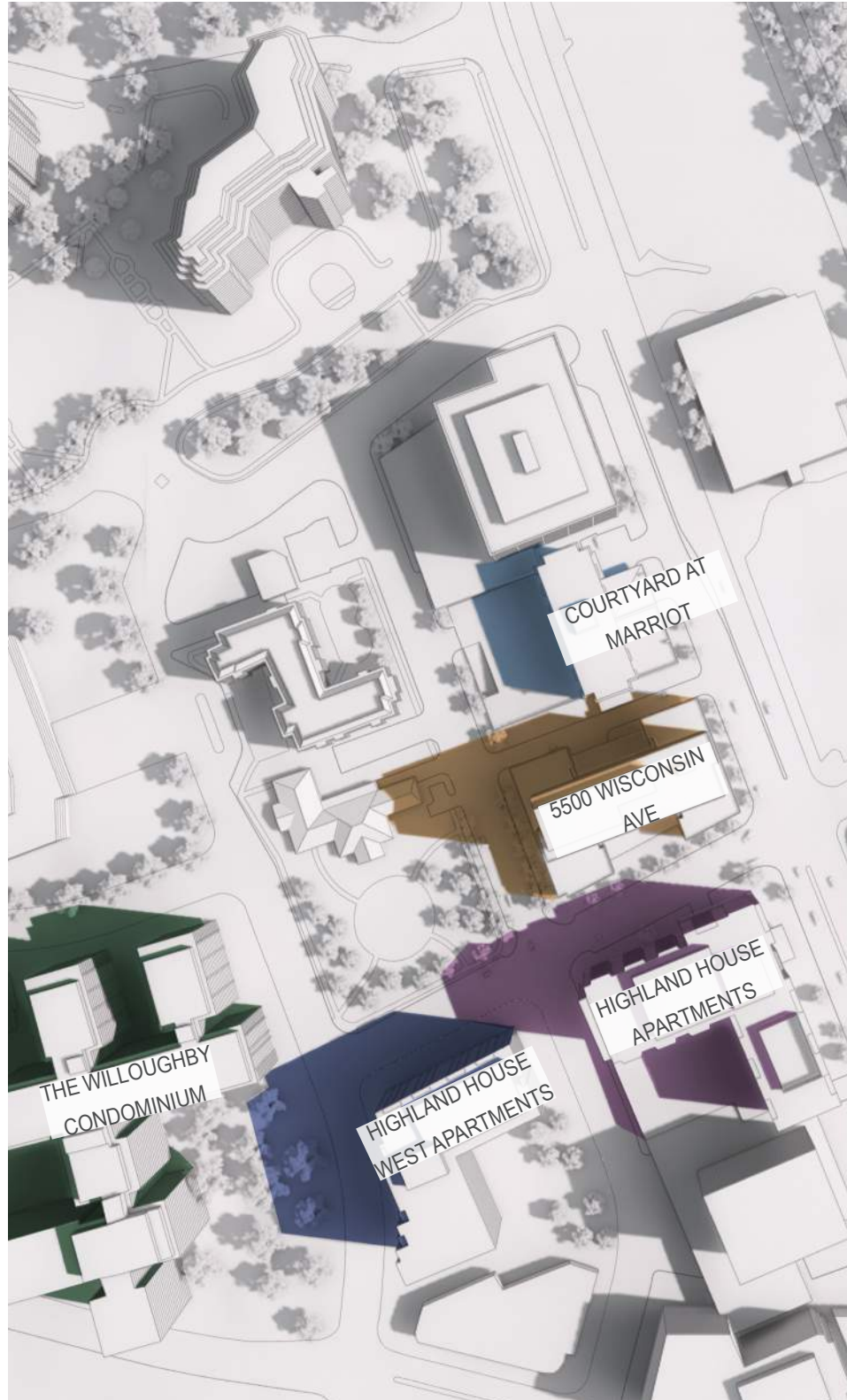
JUNE 22ND 9AM

Project has been sited to avoid casting shadows on Hubert Humphrey Park and nearby residential. Shadow of the proposed residential and retail is shown in brown. Shadows are cast primarily onto the Property itself (e.g. the Courtyard by Marriott hotel that is part of the overall Project) and the surrounding commercial and parking uses, not residential.