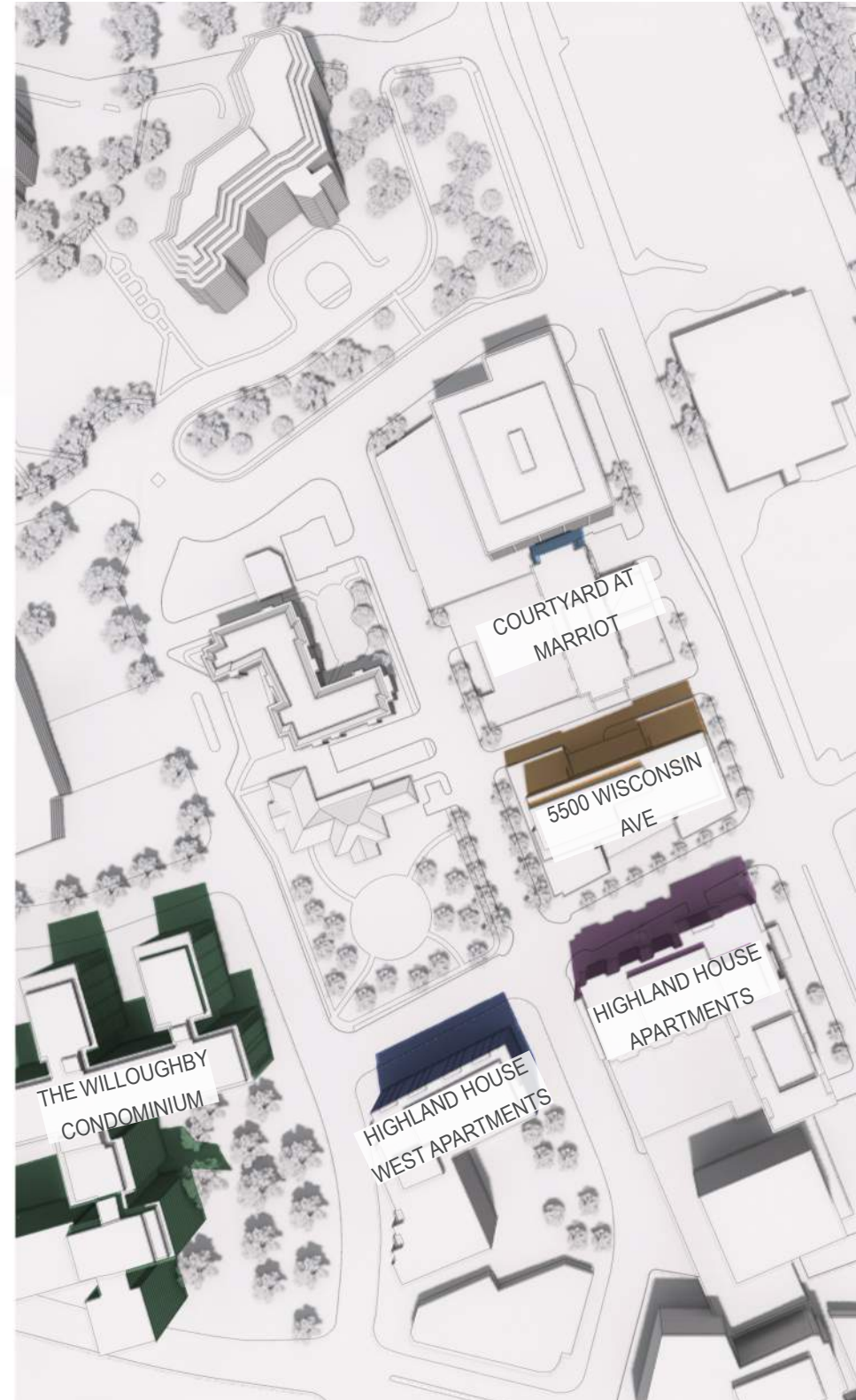
JUNE 22ND 12PM