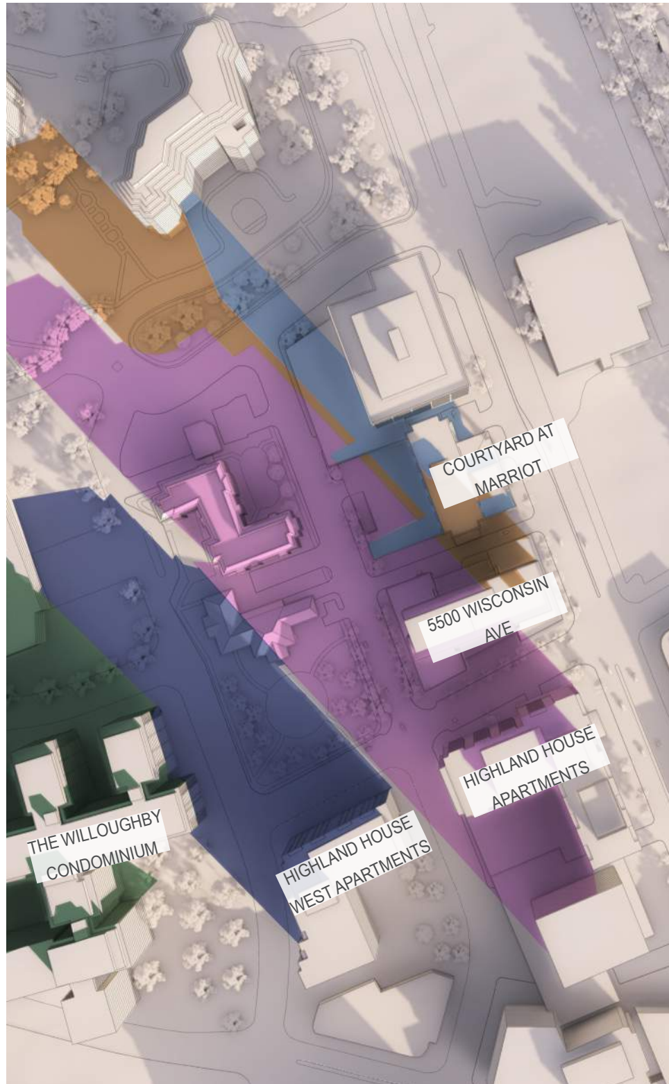
DECEMBER 22ND 9AM

Project has been sited to avoid casting shadows on Hubert Humphrey Park and nearby residential. Shadow of the proposed residential and retail is shown in brown. Shadows are cast primarily onto the Property itself (e.g. the Courtyard by Marriott hotel that is part of the overall Project) and the surrounding commercial and parking uses, not residential.