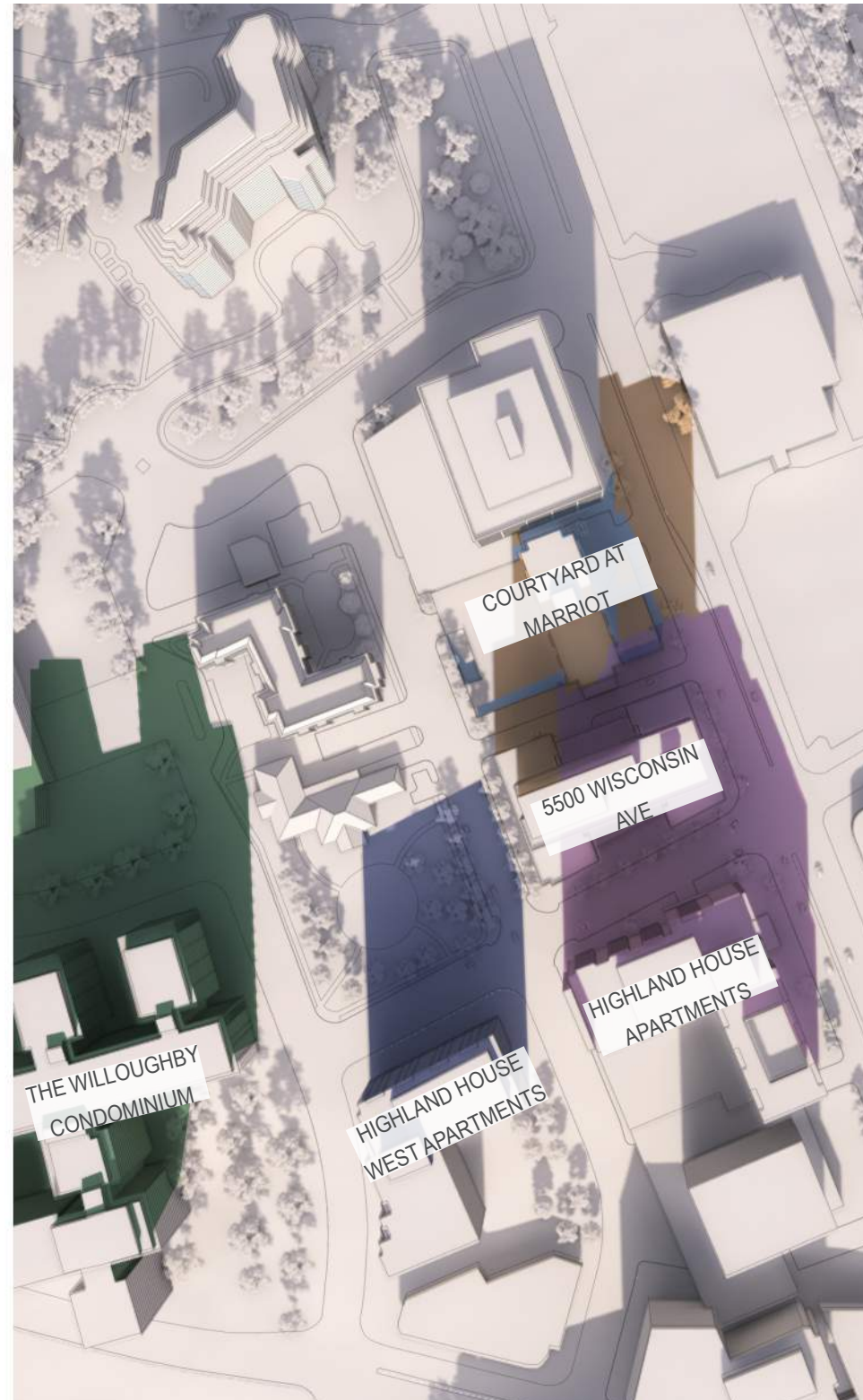
DECEMBER 22ND 12PM