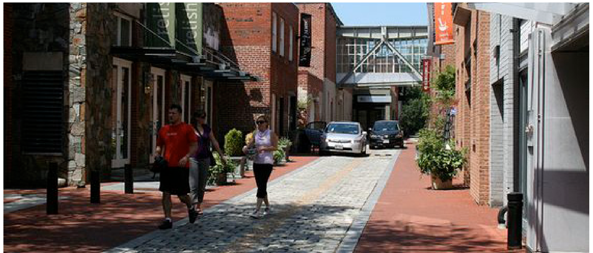
'Look & Feel' - Precedent Imagery